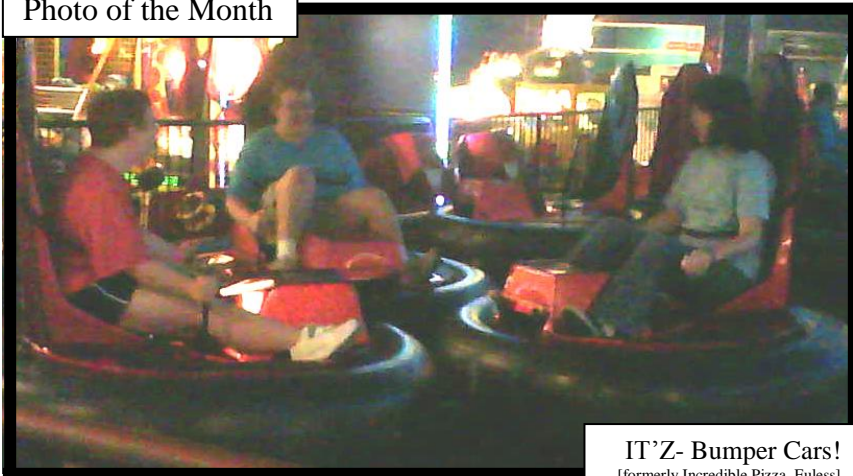
IT'Z- Bumper Cars! [formerly Incredible Pizza, Euless]